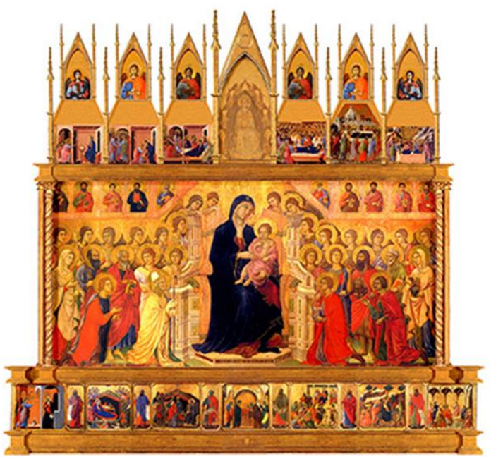
Duccio di Buoninsegna, Maestà (1308)